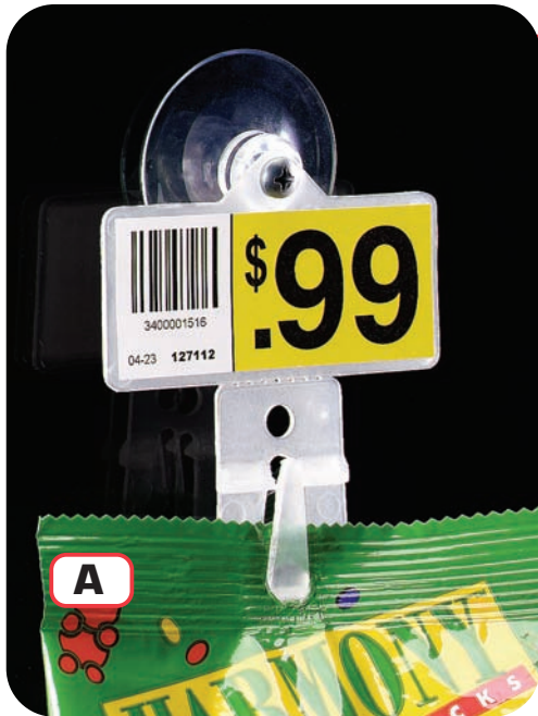
Suction Cup with Metal Screw shown holding QKR Quick•er™ Strip.

Now add extra merchandising space, promotional signage or lightweight displays to glass surfaces with the Suction Cup with Metal Screw from FFR-DSI. Cooler doors, windows, counters, fixtures and any other glass surface can be transformed into viable selling and promotional space for increased sales and maximum profits.